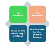
The Magi worshipped with

Luke 19:40 "I tell you," he replied, "if they keep quiet, the stones will cry out."